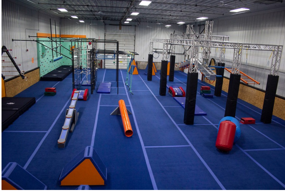
American Ninja Course